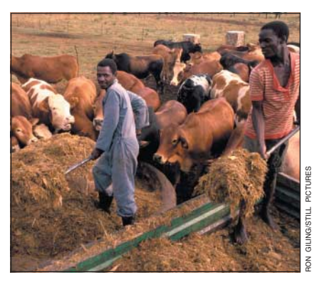
Most farmers are forced to sell at a loss

The World Bank and the International Monetary Fund (IMF) have been pushing poor African governments with aid conditions that are of no particular benefit to the people of Africa. A case in point is privatisation of organisations that provide essential services to a country's citizens-for example, telecommunications, power, water, roads, railways, banks, and ports. All these lucrative business are now in the control of powerful multinationals reaping huge profits and sending all the funds to their home countries, leaving Africa worse off than before. If the profits made by these multinationals are not ploughed back into the local economy, then this will be the worst trick that the World Bank and IMF have played on Africa and impoverished countries in general.