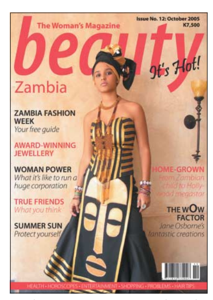
Showing a glamorous and hopeful side to life

HIV/AIDS is a prime example. According to 2003 estimates, 16% of adults in Zambia are HIV positive. Prevalence rates vary between urban and rural areas. Donors have pumped tens of millions of pounds into the country to try to tackle the