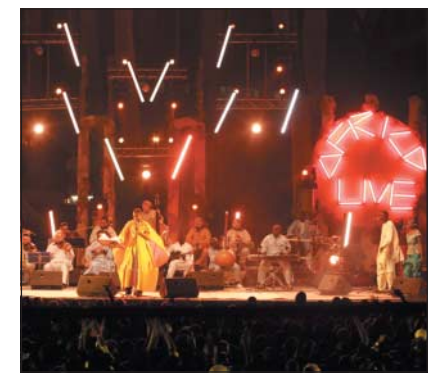
Celebrating Africa: Youssou N'Dour and the Grand Orchestre du Caire

Africa Live is also available on DVD to help educate Westerners who are unaware of Africa's malaria epidemic. Malaria was eradicated from southern Europe and the United States in the 1960s. It has reappeared with a vengeance in Africa thanks to the conflicts and disasters of the 1980s and 1990s, when control efforts and healthcare systems collapsed.