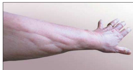
Left arm of the first woman showing puckering of the skin due to a sclerosed network of forearm veins

This complication had not previously been reported to the Committee on Safety of Medicines or the drug company, although the serious effects of extravasation of