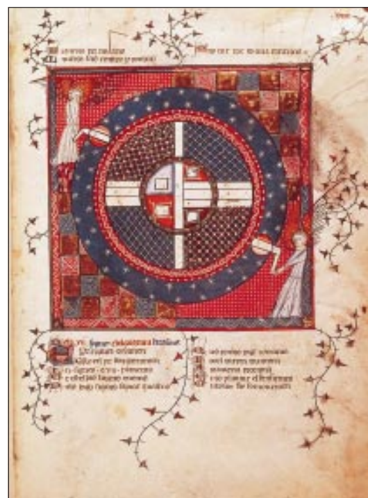
Angels make the universe turn—and time moves on

Of 3393 patients with a bloodstream infection, 1691 patients were randomised to the intervention group and 1702 to the control group. No patients were lost to