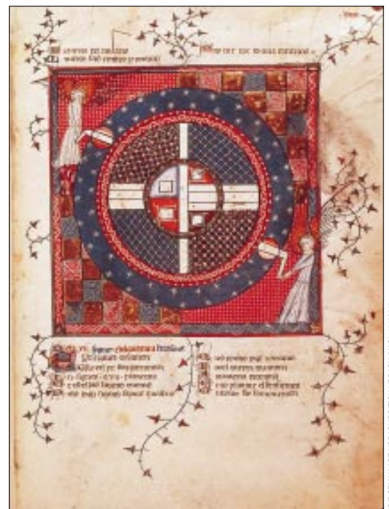
Angels make the universe turn—and time moves on

Of 3393 patients with a bloodstream infection, 1691 patients were randomised to the intervention group and 1702 to the control group. No patients were lost to