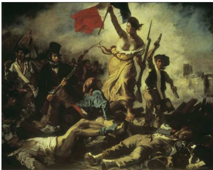
Fig 4 Liberty Leading the People by Eugène Delacroix, 1830, in the Musée du Louvre, Paris

In law and science, words are precise and accountable, justified by evidence. In advertising, the image is ambiguous and unaccountable. It makes its “killing” (an aggressive metaphor for selling) softly. Thus we arrive at the very principle of myth: to transform history into nature. 15 Associations between diseases and drugs are made to seem natural, unmotivated by commercial interest. The manifold couplings conveyed in the Aprovel advert show the principle well. Its administration for hypertension seems as natural as kissing, bathing, and other variations on a coupling theme. Condition and brand are presented as belonging to a higher logical order of things that belong to each other. To naturalise is also to neutralise or “dis-interest” the intention to promote.