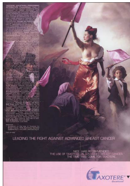
Fig 3 Taxotere: “Leading the fight against advanced breast cancer”

An industry award winner in 2001, this example (fig 3) prompted debate in the BMJ about what some saw as inappropriate eroticism. 17 It is a tableau of Delacroix’s Liberty Leading the People (fig 4). Pink silk flags substitute for sabres, muskets, pistols, and tricolour in the original painting to evoke the pink ribbons of the (drug industry sponsored) breast cancer awareness campaign. It