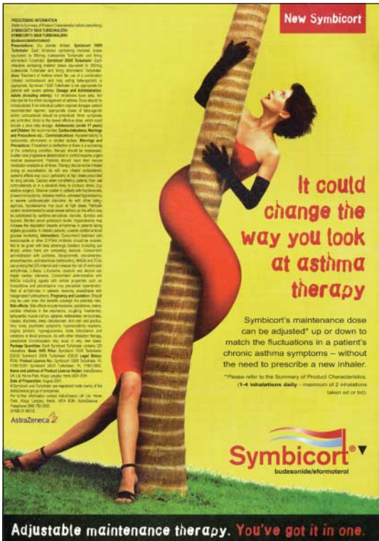
Fig 2 Symbicort: “Adjustable maintenance therapy. You’ve got it in one”

The woman is also quite taut. Her grip on the pool rim shows she is not lifting herself up but apparently resisting an uplifting force. This is another allusion to surface tension: if you imagine the board dipping into the pool and slowly lifting out, the kissing couple represent a droplet that clings and stretches between board and surface until it breaks. The kiss is a tension, joining and separating two bodies. It marries natural impulse to its acculturated expression, passion and institution, mediating between nature wild and uncontrolled (untreated hypertension) and nature tamed and pacified (medicated). The man personifies hypertension, the woman Aprovel. An explicit association between Aprovel and hypertension is linked to a series of parallel tensions: atmospheric, postural, muscular, surface, sexual. Each is paired with an appropriate response: for hot weather, bathing; for inversion, reversion; for contraction, relaxation; for a perturbed ocean, the swimming pool; for man, woman; for nature, culture; for hypertension, Aprovel. The advert naturalises an association between Aprovel and hypertension by implying their membership of an order of natural couplings. It is a sophisticated version of a generic advertising myth: for indication Y, drug X is the natural choice.