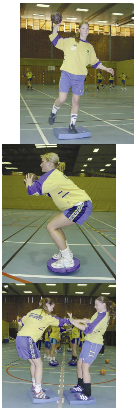
Fig 1 Top: mat exercise. Middle: wobble board exercise. Bottom: mat pair exercise