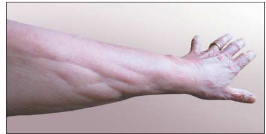
Left arm of the first woman showing puckering of the skin due to a sclerosed network of forearm veins

This complication had not previously been reported to the Committee on Safety of Medicines or the drug company, although the serious effects of extravasation of