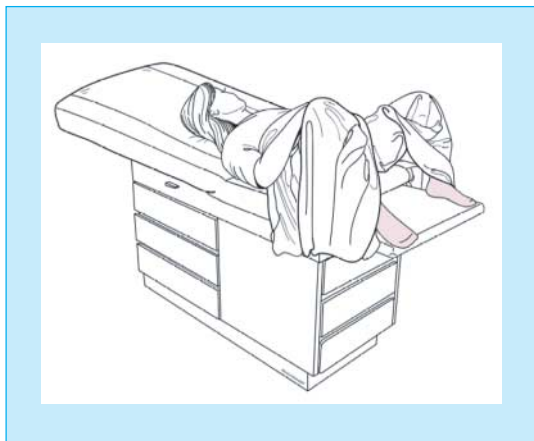
Fig 2 Positioning of women with draping for examination without stirrups (drawn by Jordan Mastrodonato)

relation to satisfaction or compliance with cervical smears. Afterwards, women completed a questionnaire regarding the examination. We used 100 mm visual analogue scales to measure physical discomfort, sense of vulnerability, and sense of loss of control. Study identification numbers were used to preserve anonymity of the respondents. We had previously piloted the questionnaire on 25 women. We assessed the quality of smears according to adequacy and the presence or absence of endocervical cells reported in the pathology reports.